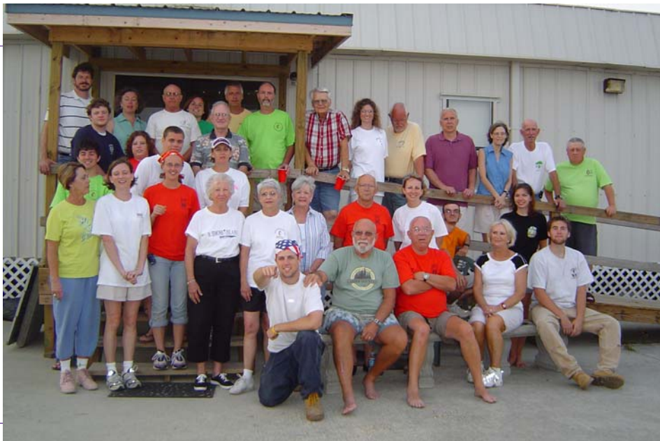
Mission Team members gather in front of Camp Gulf-side in for a farewell picture. The team resided in this facility, which is operated by UMCOR.